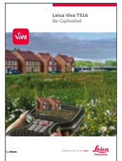
Leica Viva TS16