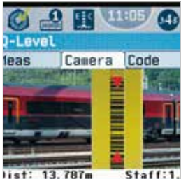
DIGITAL CAMERA AIMING