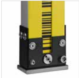
USE STANDARD INVAR STAFF