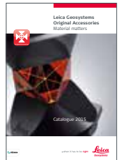
Leica Original Accessories