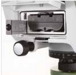
EASY DATA TRANSFER