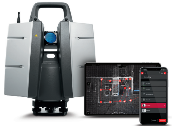
Leica ScanStation survey-grade, 3D laser scanner and Leica Cyclone FIELD 360 mobile-device app.

Heinrich-Wild-Strasse 9435 Heerbrugg, Switzerland +41 71 727 31 31