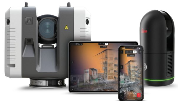
Leica RTC360 3D laser scanner with the Leica BLK360 imaging laser scanner and Leica Cyclone FIELD 360 mobile-device app.