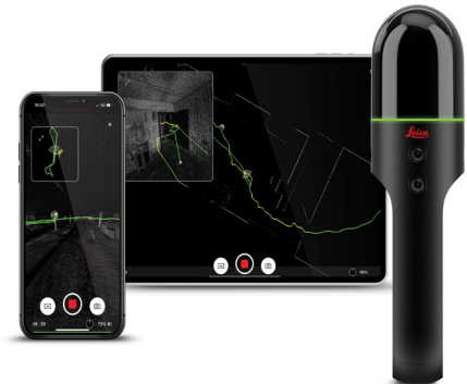
Leica BLK2GO handheld imaging laser scanner and Leica Cyclone FIELD 360 mobile-device app.

Download from Google Play Store and Apple App Store.